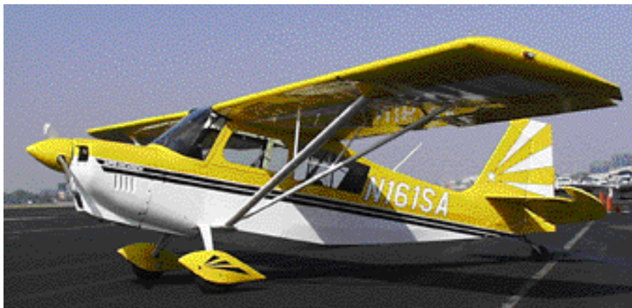
Super Decathlon 161SA