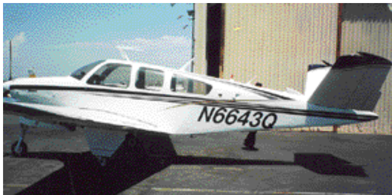
Beech Bonanza 6643Q

Checkout: all pilots will require ground and flight checkouts. Although an IFR rating is not a firm pre-requisite, pilots with limited high performance and instrument backgrounds may find it most cost-effective to develop some of the necessary skills in lower performance aircraft before moving to the Bonanza.